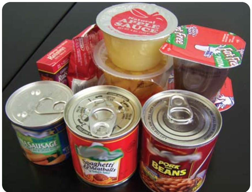
Sample Items Given to Children